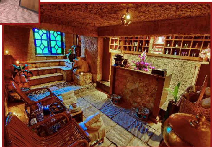
✦ Parana Spa