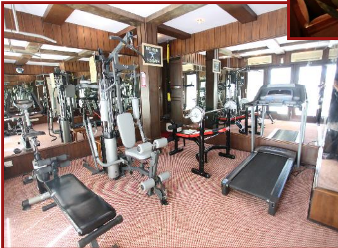
✦ Fitness Studio